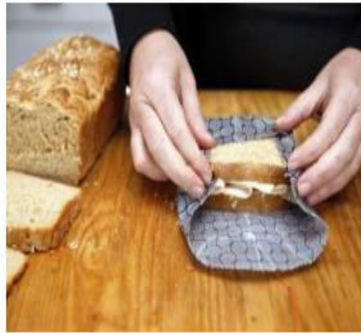
Beeswax food wrap