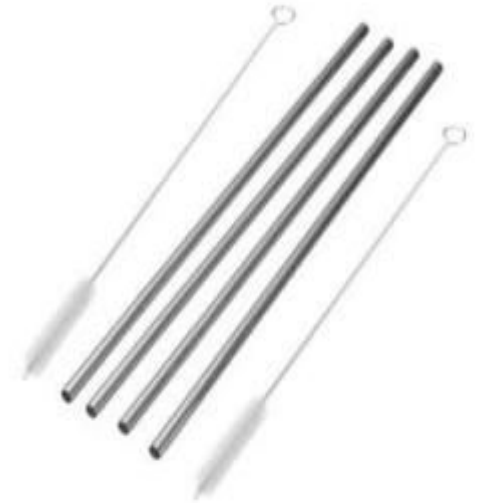
Stainless steel straws