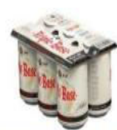
Smurfit Kappa, TopClip