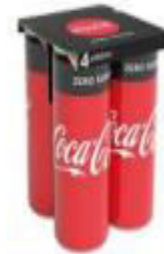
Coca Cola, KeelClip®