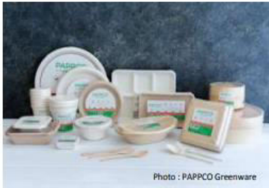
Agriculture waste-based Food cutleries and Packaging