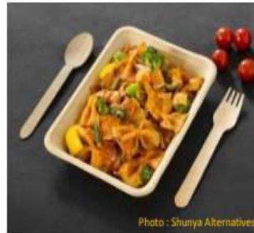
Birchwood fiber & Sugarcane fiber- based cutleries (Handmade by Delhi Artisans)