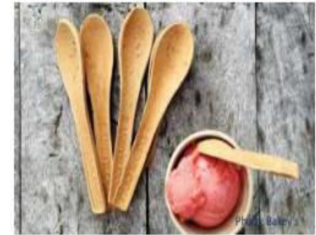
Eat it or Compost it Jowar Spoon